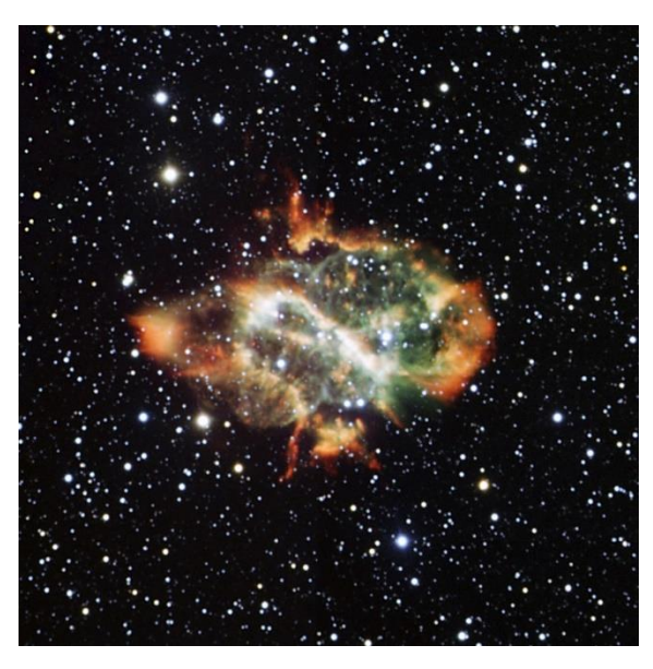
Figure 3. Image from an ESO telescope in Chile of Planetary Nebulae PN NGC 5189. Some say it looks like a Chinese flying Dragon in space.

The Journal paper can be accessed here: <a href="https://iopscience.iop.org/article/10.3847/2041-8213/ad1ed9/pdf">https://iopscience.iop.org/article/10.3847/2041-8213/ad1ed9/pdf</a>